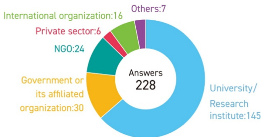
Fig. 1. Votes by group.

Among innovations, high-tech products may come to mind first. However, the results indicate that products and approaches can both have great impacts on reducing disaster risks. It is extremely important to use approaches together with products as a framework and guiding principle for the application and implementation of products and to analyze issues using the tools of the social sciences aspects: developing new thinking on risk, vulnerability and poverty, the risk process, and the role of humans in the accumulation of risk [8]. Both products and approaches bring multiplier